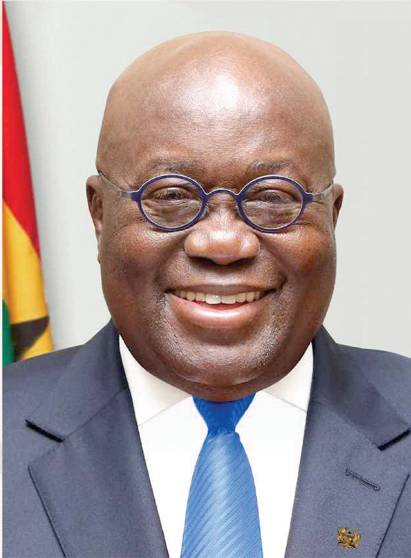
H.E. NANA ADDO DANKWA AKUFO ADDO PRESIDENT OF REPUBLIC OF GHANA