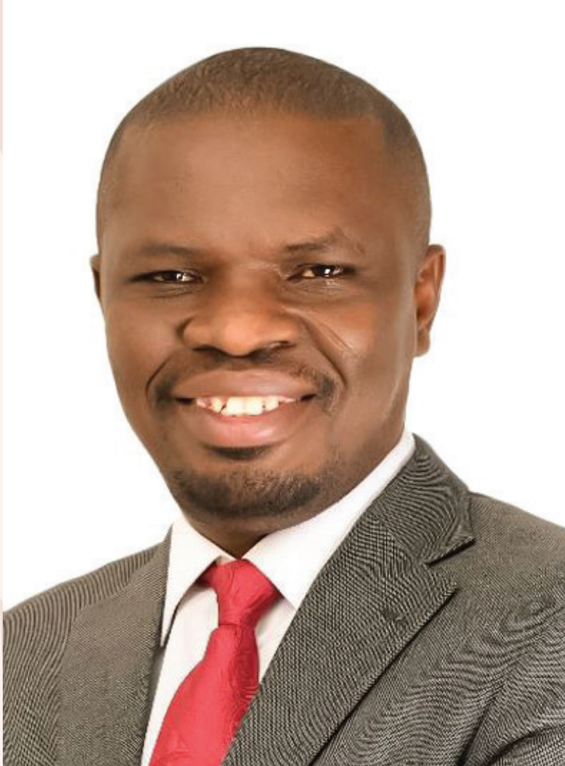
HON. MUSTAPHA USSIF MINISTER OF YOUTH AND SPORTS