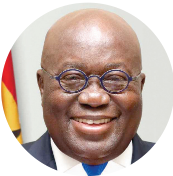
H.E. Nana Addo Dankwa Akufo Addo